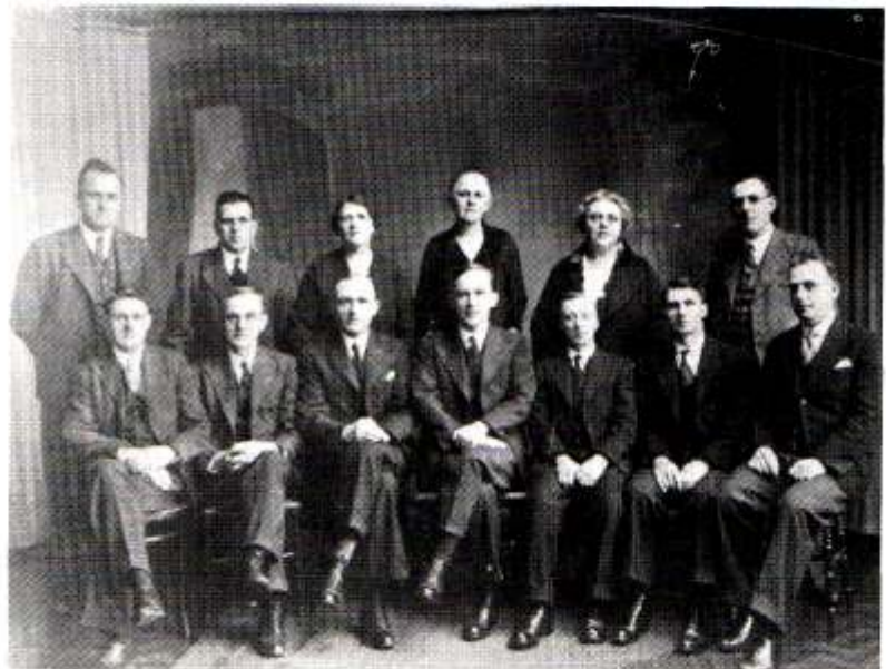
Minister and Church Committee, Sandfields, 1937

The author is the present minister of Bethlehem Evangelical Church, Sandfields, Aberavon.